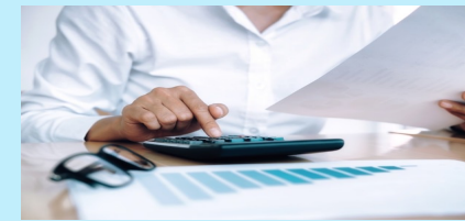
Mutual Financial Savings