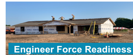
Engineer Force Readiness