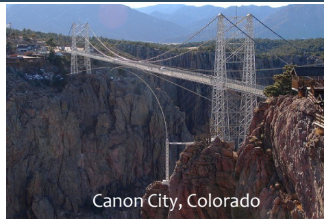
Canon City, Colorado