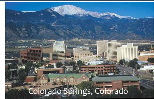
Colorado Springs, Colorado