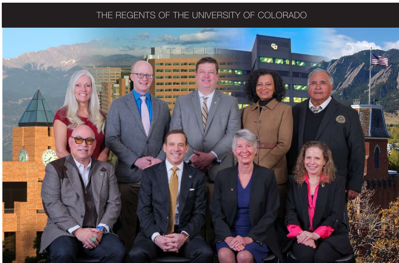
THE REGENTS OF THE UNIVERSITY OF COLORADO

The Regents of the University of Colorado