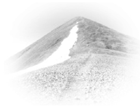
Mt. Red Cloud