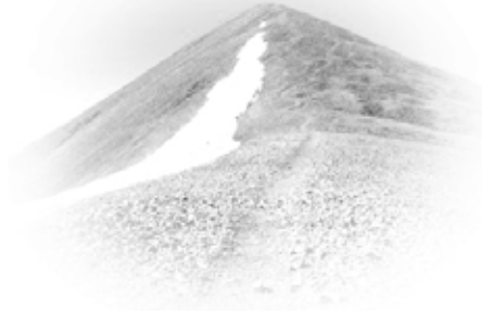
Mt. Red Cloud